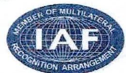
President - AJA Registrars Inc.

This certificate is issued in respect of the locations & scope of registration detailed in the Associated Registration Schedule. This certificate is the property of AJA Registrars Inc., 2nd Floor JD Tower Commerce Avenue, Madrigal Business Park, Ayala Alabang, Muntinlupa City 1770, Philippines and must be returned on request. A member of the AJA Group of Companies